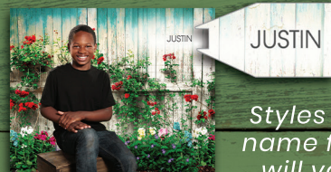
Styles and name fonts will vary.

Add personalization to your selected style by ADDING YOUR NAME to each print.